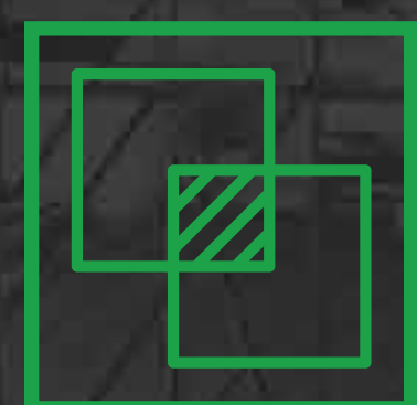
Image Fusion (day and thermal)

Temperature measurements capabilities and color pallets for better versatility.